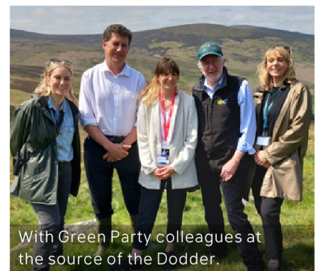
With Green Party colleagues at the source of the Dodder.