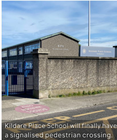
Kildare Place School will finally have a signalised pedestrian crossing.

At a public meeting in April, I detailed some of the cycling routes set to be delivered in this area in the next 3 to 5 years, including: Harold's Cross to Ballymount, Terenure to Kimmage, Rathmines to Milltown, Rathgar to Ranelagh, and the South City Loop; along with improvement of the Grand Canal on road cycle scheme and commencement of Grand Canal S2. We've also seen the arrival of school zones in the area. Having first requested it in 2021, I'm delighted that the school zone for Kildare Place National School will include a signalised pedestrian crossing. That project is out to tender now.