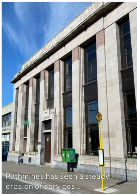
Rathmines has seen a steady erosion of services.